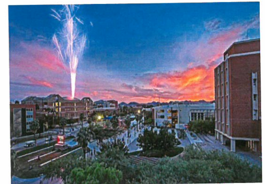
Fireworks off the roof of Koffler to celebrate the launch of Arizona Now, the UA's capital fundraising campaign on April 11, 2014.